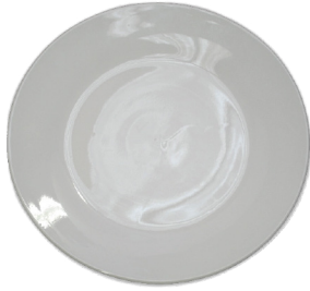
Dinner Plate 10.5" Diameter