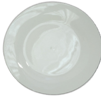
Salad Plate 7.5" Diameter