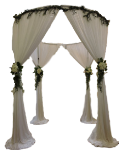
Circle Canopy Arbor 10'4" D x 8'H