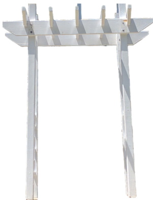
White Wood Arbor 6'4"L x 4'8"W x 8'0"H