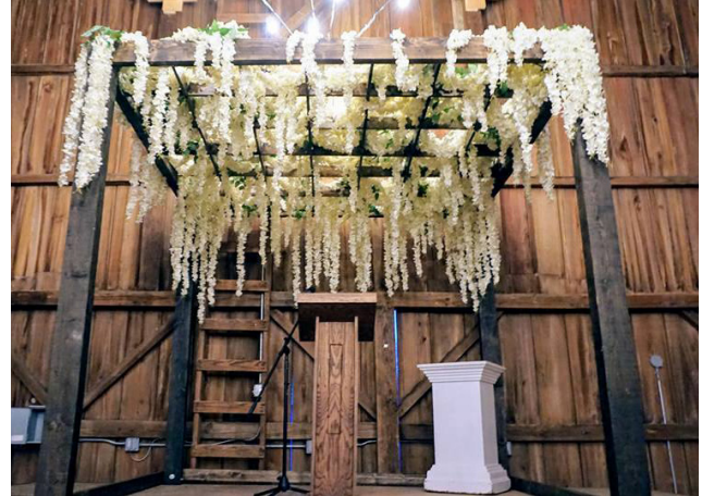
Mahogany Arbor with Wisteria Flowers