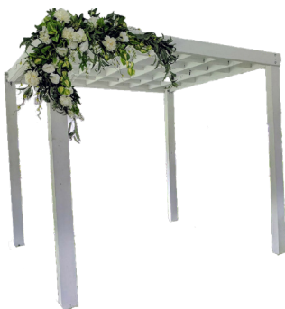
Large White Wood Arbor 9'0"L x 7'8.5"W x 8'0"H