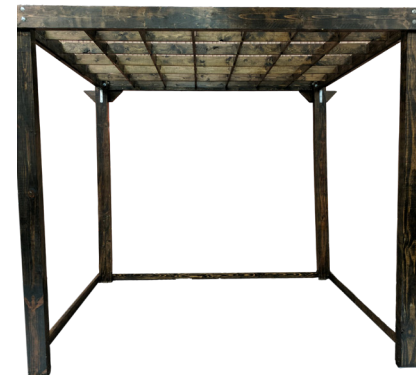
Dark Roast Arbor 8'L x 6'W x 8'H *also available in large, suitable over 8' table*