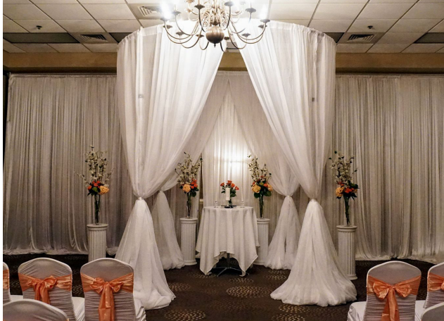
Circle Canopy Arbor with White Draping

Popularly used for ceremonies and sweetheart tables, adding an arbor to your wedding or event will give it that extra-special touch. Combine with flowers, greenery, or draping of ours or of your own to dress it up even more! Whether it is to match your theme or simply add a personal touch, your guests are guaranteed to be amazed!